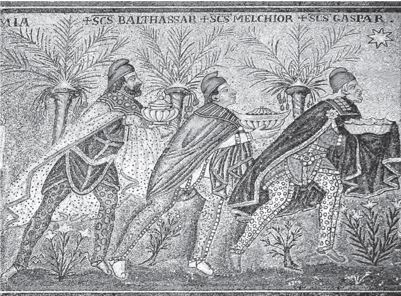
"The Three Wise Men" detail from a mosaic in the Basilica of Sant' Apollinare Nuovo in Ravenna, Italy, completed in 526 A.D.

For Mixed Voices, Optional Alto and Baritone Soloists, and Organ